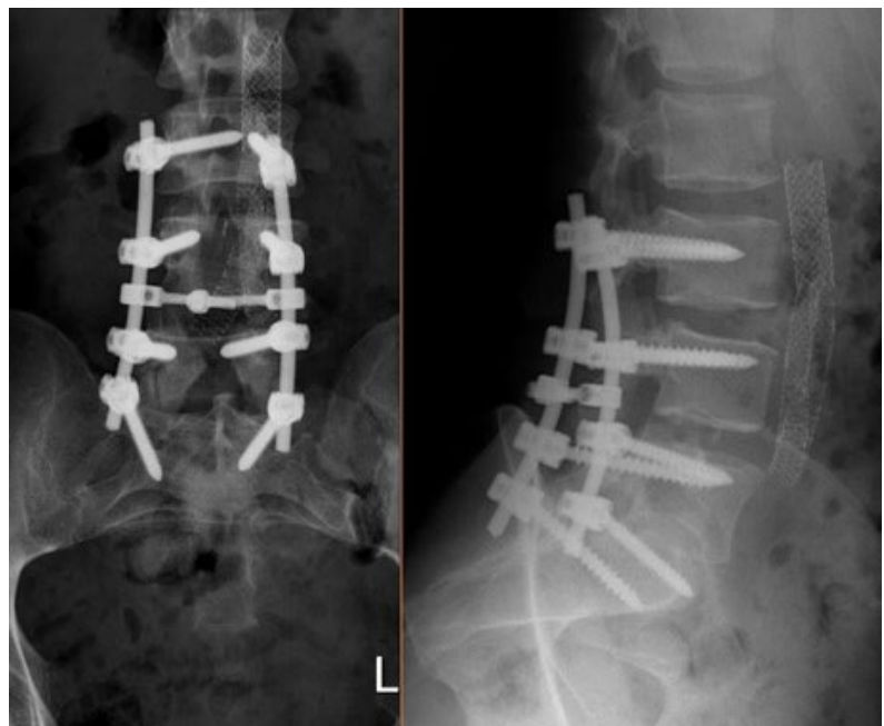
Figure 3. Surgical reduction and transpedicular fixation of L4 vertebral dislocation