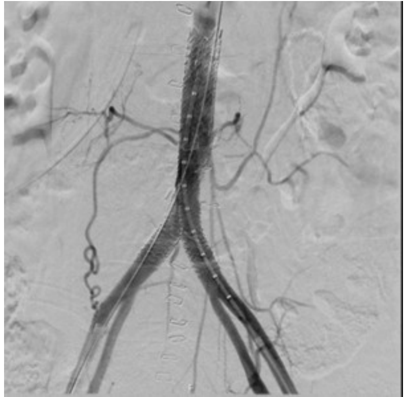
Figure 2. Repair of aortic dissection using CERAB technique